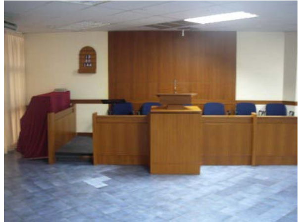
Photo 11 - Chapel area on the first floor

The long term plan for this property is to tear down the existing building and construct a new multi-use building on the site. One day, at sometime in the future, this site will become the new "center of the church" in Thailand.