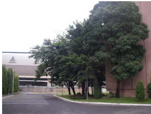
Photo 9 - Makasan Terminal in back of the New Petchaburi property

In the adjacent photo you can see the west end of the existing building on this property. In back of the building you can see a small part of the new Makasan terminal on the new Airport Rail Line. From that terminal you can travel to the Suwanaphumi Airport in just 15 minutes on the "express train" (nonstop) for just 150 Baht. The terminal is just a 10 minute walk from the New Petchaburi property. Patterned after the "City Airline Terminal" in Tokyo, the new facility will allow passengers to check their bags at the Makasan station and "check-in" for their flights prior to boarding the train to the airport (starting in 2011). This new train is the fastest and smoothest in Thailand. It was a great ride.