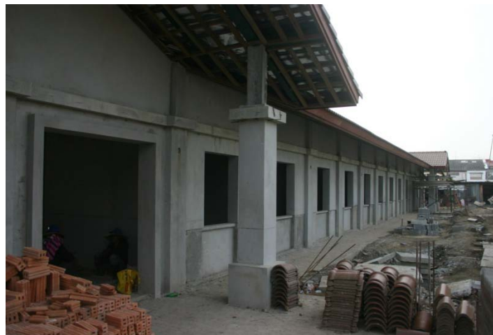
Photo 3 - New building - Classroom Wing

The new building is larger than any of the existing buildings in Thailand. As you can see from the photograph the construction is mostly cinder block covered by plaster with steel for the roof joist. The roof tiles awaiting installation can be seen in photographs 3b and 4. We arrived at the site at about 6pm on Friday and yet there were many construction workers still engaged in work, including several females.