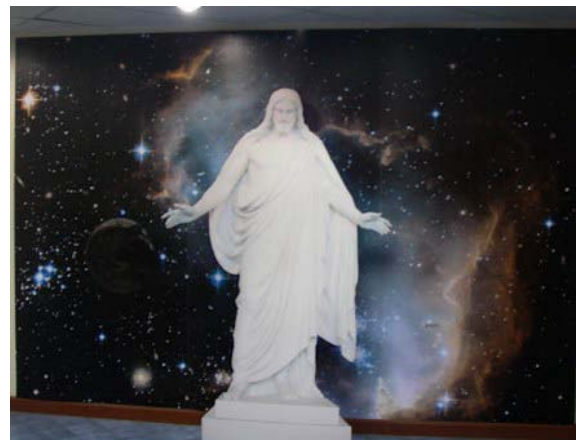
Photo 13 - Statue of Christ in the Lobby