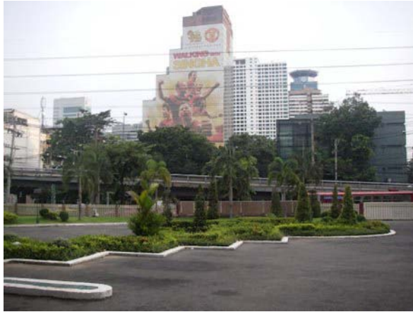
Photo 12 - Well kept landscape in front of the New Petchaburi Building. The new overpass can be seen beyond the church property