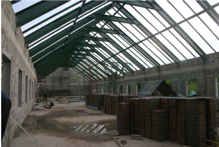
Photo 4 - New building chapel and cultural hall