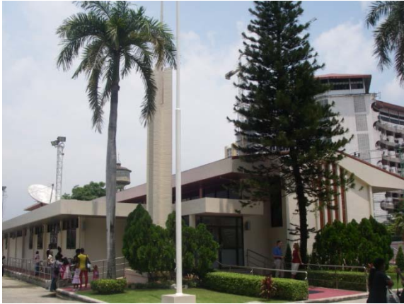
Photo 1 - Asoke Building Exterior

During 2009 the chapel at Asoke was remodeled. The outside was not modified much at all, but the inside was re-furbished throughout, new lighting in the chapel, new tile in the cultural hall, new doors and door trim. The main entry was extended outward to almost then end of the roof overhang. The