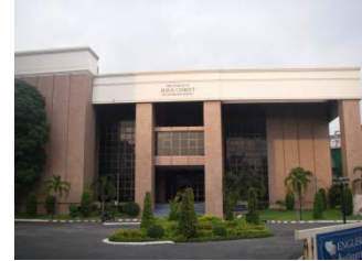
Photo 8 - The Building owned by the church on New Petchaburi Road Bangkok

The church property on New Petchaburi Road (not far from Soi Asoke) became more valuable in August 2010 when the new "City Airline Terminal" Makasan was completed literally over the back fence. The church property was purchased in 2008. While the Asoke building was being remodeled the Asoke Ward and the Din Daeng branch met in the office building on the new property. Today, only the Din Daeng branch meets in the building.