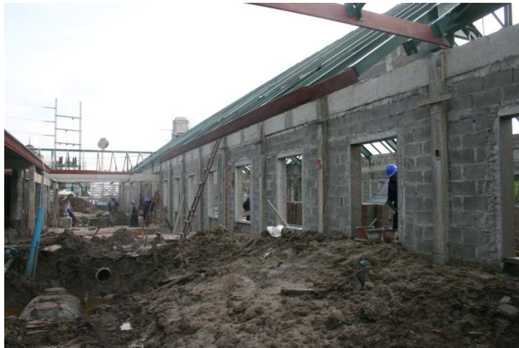
Photo 5 - Area between the two wings